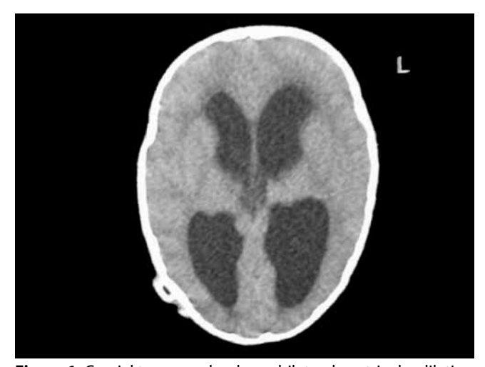
Figure 1: Cranial tomography shows bilateral ventricular dilation and periventricular edema.

Placement of a VP shunt is a worldwide accepted procedure for treatment of hydrocephalus. Various intra-abdominal complications of this procedure include perforated viscus, inguinal hernia, hydrocele, and abdominal CSF pseudocyst. Common presentations of CSF pseudocyst are abdominal pain, distension, abdominal mass, intestinal obstruction, and shunt dysfunction (5,7). Our patient interestingly presented