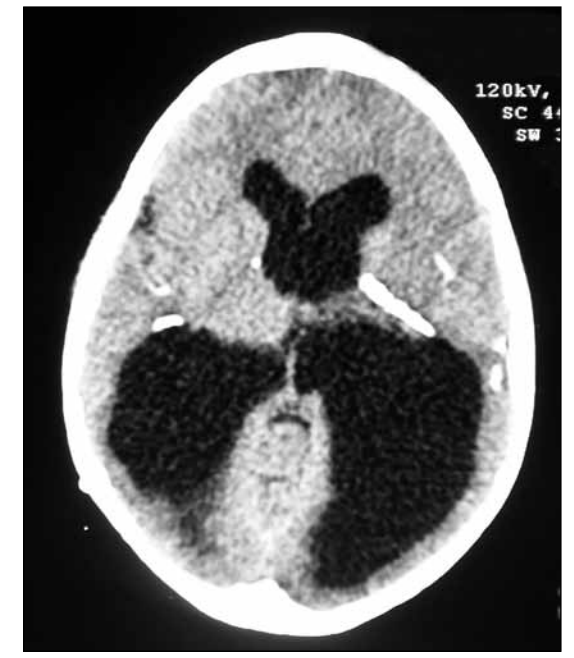
Figure 2 : CT scan shows enlarged occipital horns of the lateral ventricles and calcifications in the brain.

Peroxide-treated silicone (Silastic) catheter for the surgical treatment of hydrocephalus is employed since 1950. These catheters are used more frequenty than the other types,