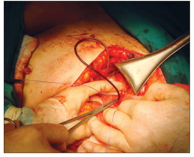
Figure 2: Surgical explorative view of peritoneal catheter perforating stomach.