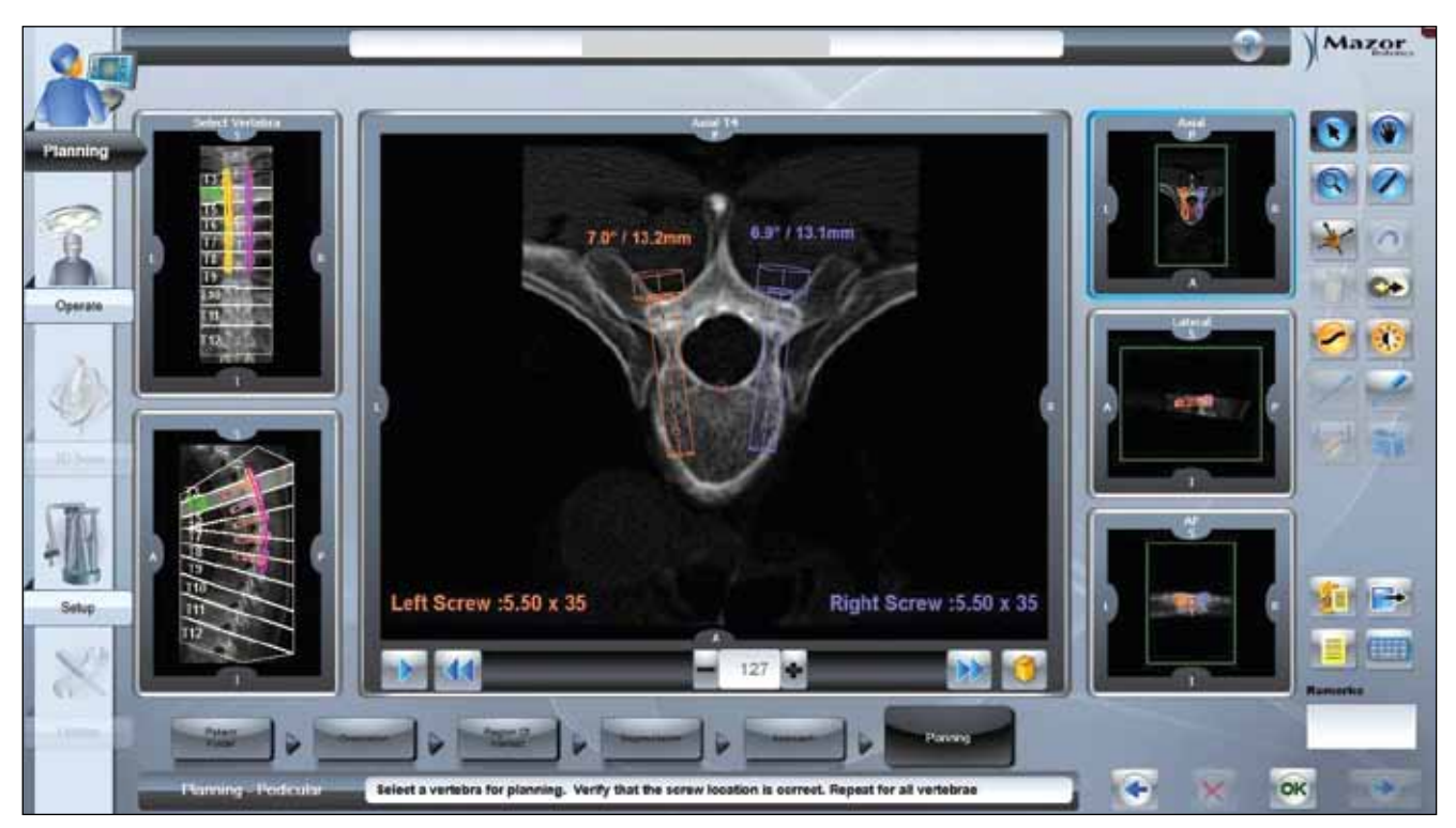
Figure 2: Preoperative planning with the software of Renassaince.