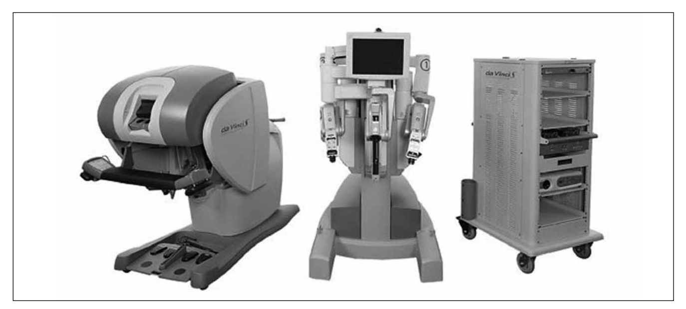
Figure 1: da Vinci robotic system (Reprinted with permission).

In 2006, O' Malley et al. presented a group of first robotassisted transoral surgeries. In this group, 3 squamous cell tumors were operated on. During this study, it was stated that