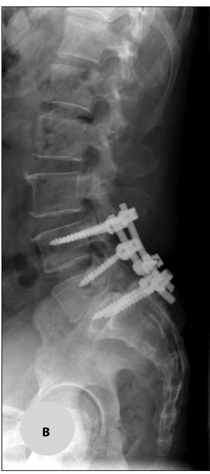
Figure 3: A) Anteroposterior and B) lateral postoperative radiographs showing good bony fusion.