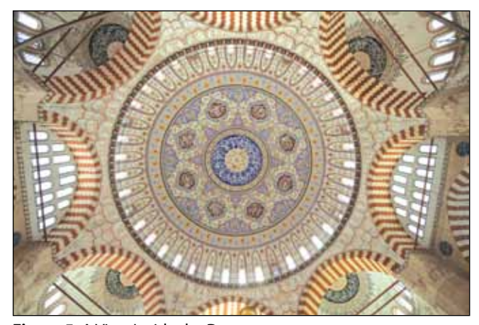
Figure 5: A View Inside the Dome.