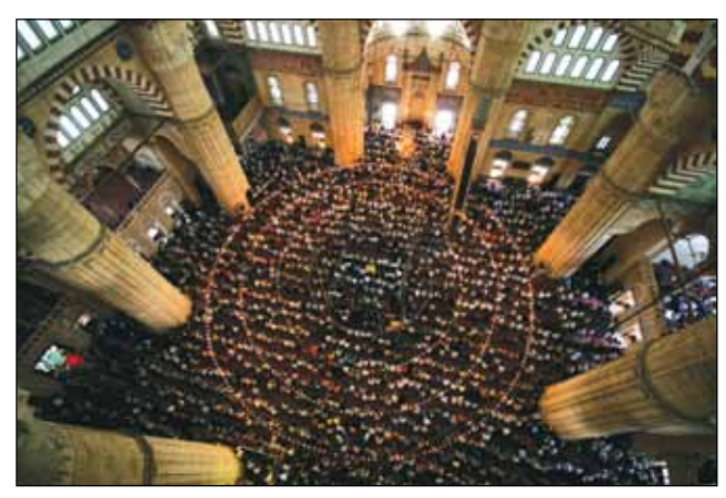
Figure 3: A View from the Worship Area (Harim).

The contribution of the minarets covering the dome from afar and strengthening the sense of verticality in the mass composition plays a great role in making the structure