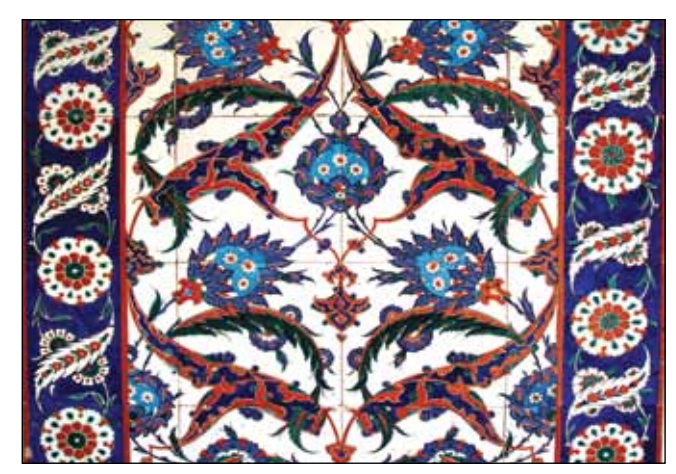
Figure 6: One of the Selimiye Mosque Tiles.

created a legend that evokes nearly the whole structure and even Edirne. The Sultan's Mahfel is decorated with dazzling tiles. This structure constitutes the culmination of aesthetics with its minbar that is a unique example of marble work, the decoration tiles used in the interior, kalemisi (hand ornamentation) and marble fountain (shadırvan) in the middle of the courtyard surrounded by porticos. (Turan: 2013)