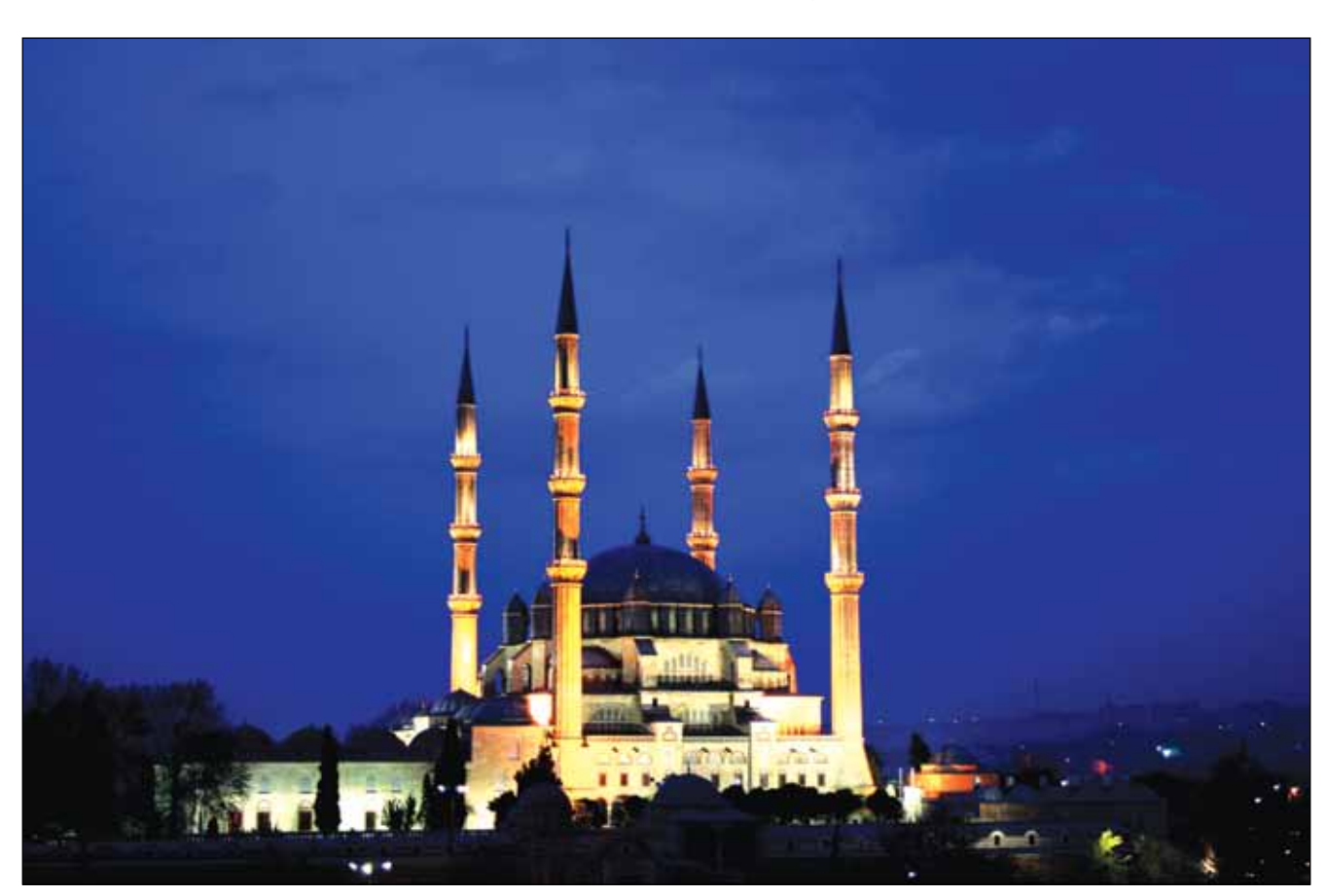
Figure 1: Selimiye Mosque.

The Selimiye Mosque was built by Sinan the Architect at the age of 80 and was called "My Masterpiece" by Sinan. The structure consists of nine base units as follows: the Selimiye Mosque, Dar'ul Kurra Madrasa, Dar'ul Hadis Madrasa, Sibyan (Primary) School, Arasta, the Clock House (Muvakkithane), the Library, the courtyard with shadirvan and the outer courtyard. In this context, Arasta Bazaar was built by Davut Aga the Architect during the reign of Murat III in order to yield income for the mosque.