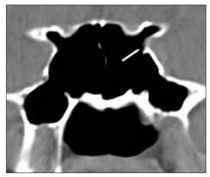
Figure 2: CT image showing (arrow) dehiscence of the bony wall around the internal carotid artery.

According to Bademci and Unal, 2005 (1), assessment of sphenoid sinus using both coronal and axial scans is accepted as the gold standard of the study. However, Davoodi et al. (2) state that coronal scans are useful in detecting protrusion of optic nerve and Vidian nerve and dehiscence of maxillary nerve and Vidian nerve, whereas axial scans are superior in assessing Onodi cells. Moreover, they opine that choosing one of the planes exposes the patient to less radiation and also saves the patient's time and money. In our study, we have included only coronal sections of CT scans for the study of sphenoid sinus and therefore the focus of the present study is on the dehiscence of the surrounding bony wall and the protrusion, of the structures that relate to the sphenoid sinus.