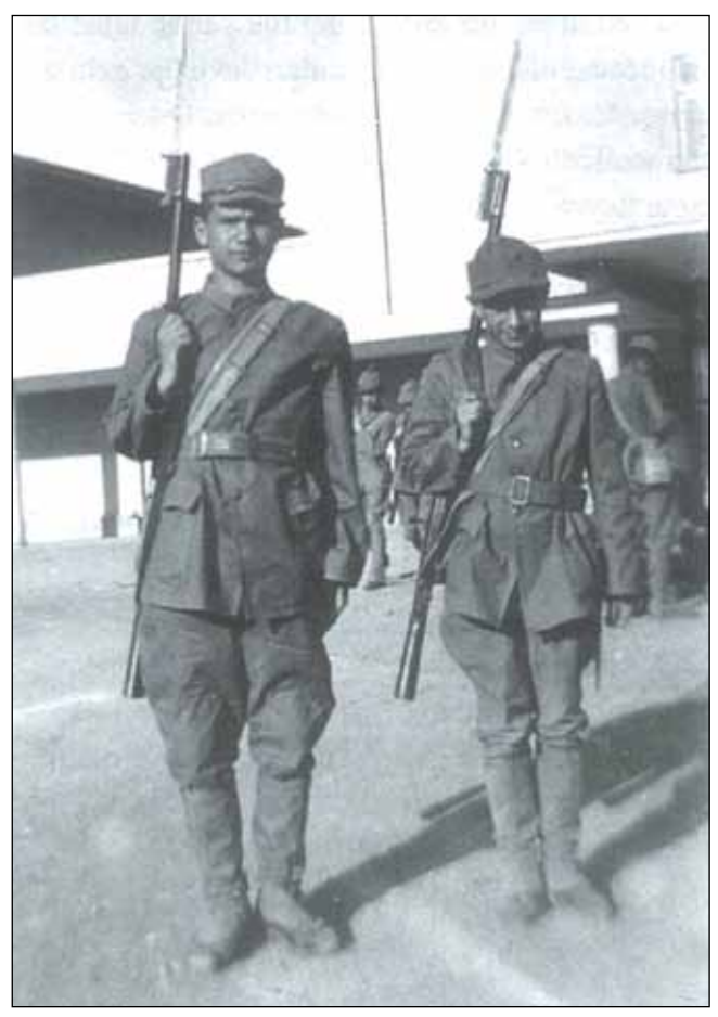
Figure 1: Yasargil and Yücel's photograph when they were soldiers (11).

sâfi tümor celladı kızdırmasın gelsin diyor 'bin kelleyi bir cıdaya dizerim kızarsa beynim' diyor ..."