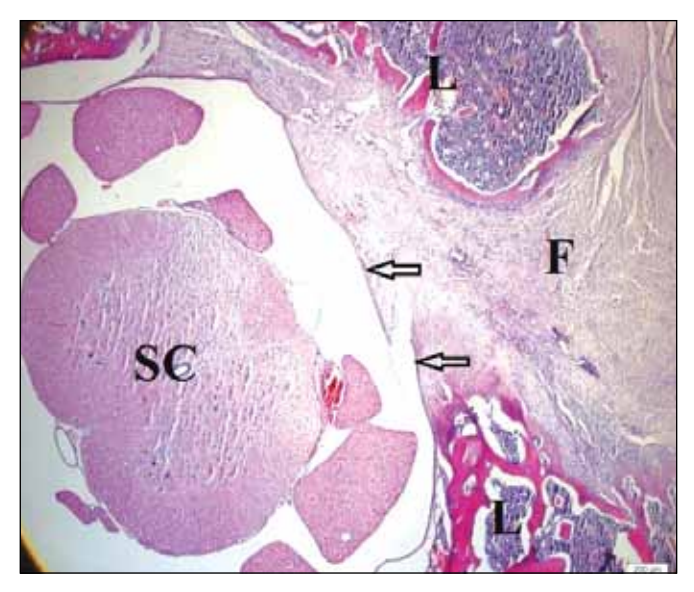
Figure 2: Microscopic image shows Grade III fibrosis as observed in the control group. The epidural fibrosis adhered to the underlying dura mater. L= lamina; F= fibrosis; SC= spinal cord; Black arrows= dura mater. Scale bar=200 μm.

Epidural fibrosis develops with the combination of fibroblasts and elements including inflammatory cells and collagen produced by fibroblasts. As a result of adhesions stemming from epidural fibrosis formation, a pressure and tension effect is seen on the spinal cord and nerves (4,19,38). This adhesion may disrupt the arterial supply, venous drainage and axoplasmic transport in the nerve fibers. Although there is no consensus about the mechanism of the scar tissue in the etiology of the pain, it is reported that the adhesions cause pressure on the surrounding anatomical structures and increase the sensitivity of the nerve tissue in addition to the limitation of mobility in the nerve root (10,18,30,45).