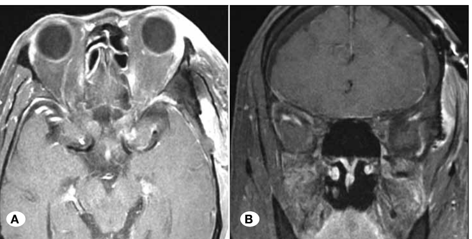
Figure 3: A, B) Postoperative Gadolinium-enhanced axial and coronal MRI showing no residual tumor.