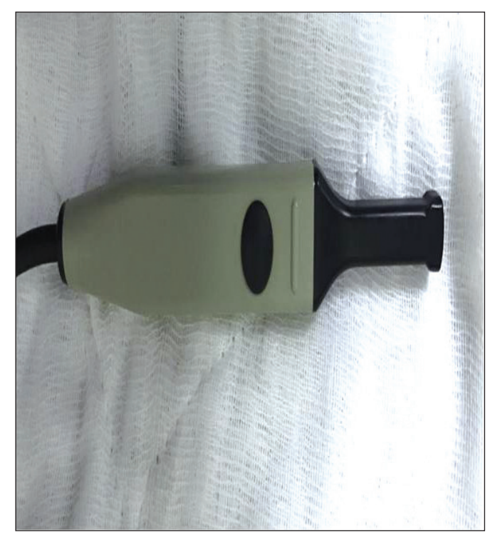
Figure 1: The IOUSG device probe.

A postoperative MRI scan with and without Gadolinium was also performed within the first 48 hours to all the patients to determine a rest tumor.