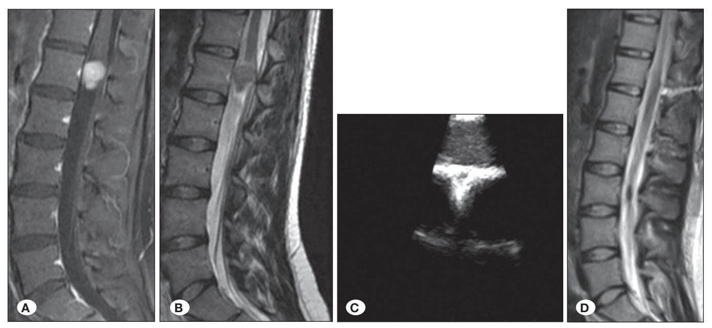
Figure 2: Sagittal T1W contrast enhanced (A) and T2W (B) MRI images of a case with L1 meningioma, C) IOUSG image of the case, D) postoperative sagittal T2W MRI image.