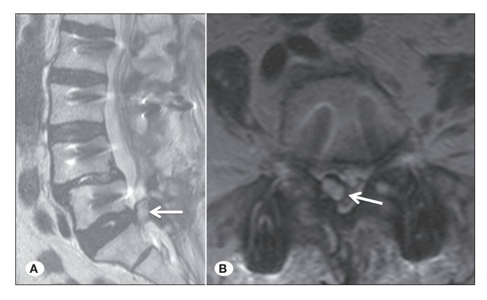
Figure 1: Juxtafacet cyst at the L5-S1 level, adjacent to the instruments. A) Sagittal T2W MRI (arrow shows juxtafacet cyst). B) Axial T2W MRI (arrow shows right juxtafacet cyst).

The patient who has two cysts had two MRI in 6 months. Bilateral L3-L4 juxtafacet cyst was noted on her first MRI, but the cyst on the right side disappeared on the last MRI (Figure 2A-C). Decompression was performed on both sides since she was suffering from bilateral leg pain. The right cyst that