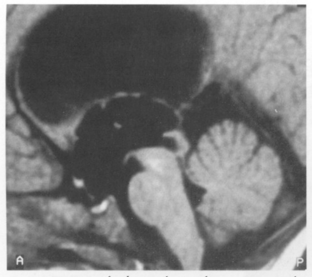
Fig. 1 : MRI T1 weighted sagittal scan showing triventricular hydrocephalus, and a membraneous acqueduct stenosis. (Feb. 2nd. 1992)

Fransen: Cranial Migration of a Ventriculo Peritoneal Shunt