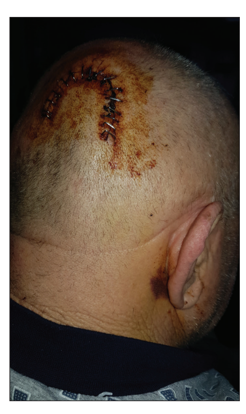
Figure 1: Retroauricular or mastoid ecchymosis after VP shunt surgery.