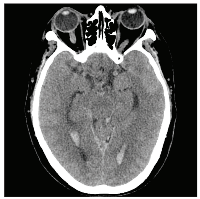
Figure 1: A pre-operative computed tomography scan showing intraventricular and subarachnoid hemorrhage.