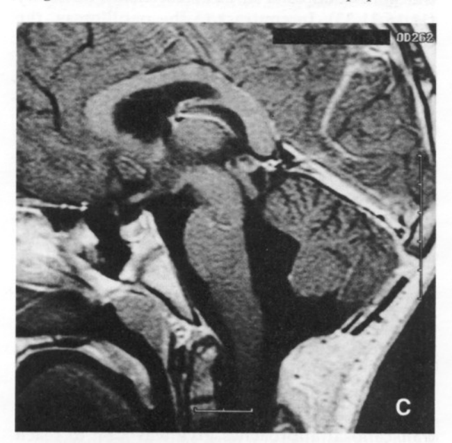
Figure 2a. Fourth ventricular, enhanced papilloma (T1 weighted axial image with GdDTPA), 2b. Sagittal image of the tumor filling all of the fourth ventricle (T1 weighted image with GdDTPA), 2c. Postoperative T1 weighted image shows total tumor excision.

All of the cases presented here were diagnosed with both MR and CT. In CT papillomas