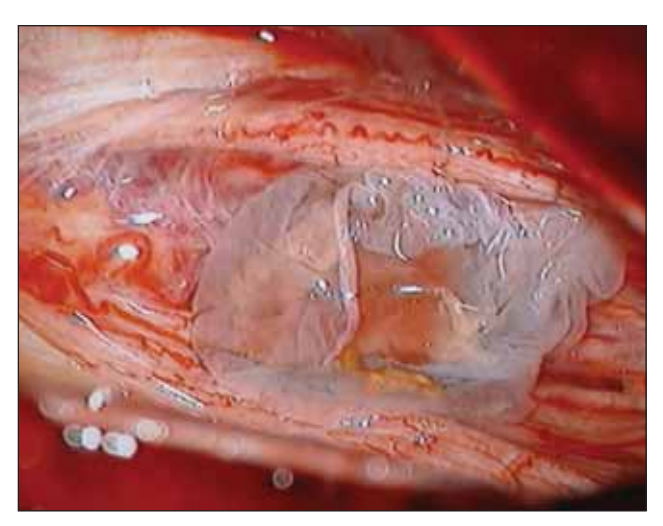
Figure 2: Intraoperative photograph of SCSDH: blood clots and yellow hemosiderin deposits are demonstrated after dissection of the semi-transparent neo-membrane.

complaints showed improvement with no neurological deficits. Factor VIII replacement therapy was continued until the patient was discharged on postoperative day 8 without complications. Radiological follow-up with spinal MRI showed no residual pathology and decompression of the spinal cord with normal anatomy (Figure 3).