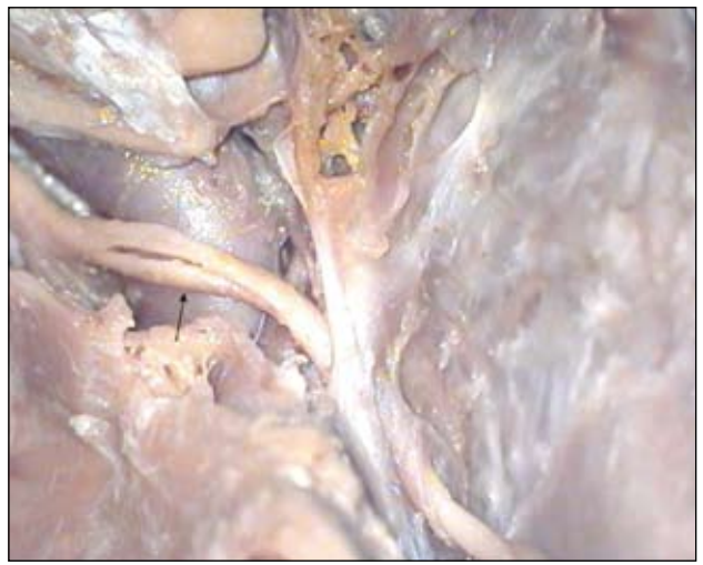
Figure 2: Double branching of the abducens nerve at the cavernous segment of the abducens nerve in a right-sided specimen (arrow). This type bifurcation of the nerve without intervening tissue was labeled "pseudobranching".