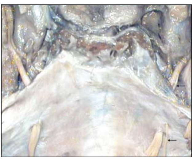
Figure 5: Branching of the petroclival segment of the abducens nerve on this left-sided specimen (arrows). Note that the branches of the nerve enter the dura separately.

Duplication of the abducens nerve in its entirety was not encountered in any our specimens. In 10 (50%) of the 20 skull bases, the same branching pattern was found bilaterally. The AN coursed over the petrosphenoidal ligament bilaterally in one case (two specimens, 5%). This same skull had calcification of the petrosphenoidal ligament on both sides. The nerve coursed below the ligament in the remaining 38 (95%) specimens. Regarding the course of the AN below the petrosphenoidal ligament, including the main trunks of branched nerves at the petroclival