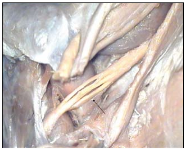
Figure 3: Triple branching of the abducens nerve at the cavernous segment in a left-sided specimen (arrow). As in "figure 2" it was labelled "pseudobranching", because there is no intervening tissue.

Duplication of the abducens nerve in its entirety was not encountered in any our specimens. In 10 (50%) of the 20 skull bases, the same branching pattern was found bilaterally. The AN coursed over the petrosphenoidal ligament bilaterally in one case (two specimens, 5%). This same skull had calcification of the petrosphenoidal ligament on both sides. The nerve coursed below the ligament in the remaining 38 (95%) specimens. Regarding the course of the AN below the petrosphenoidal ligament, including the main trunks of branched nerves at the petroclival