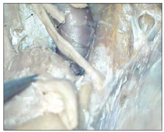
Figure 4: Branching of the cavernous segment of the abducens nerve in a right-sided specimen, which continues into the superior orbital fissure (arrows).