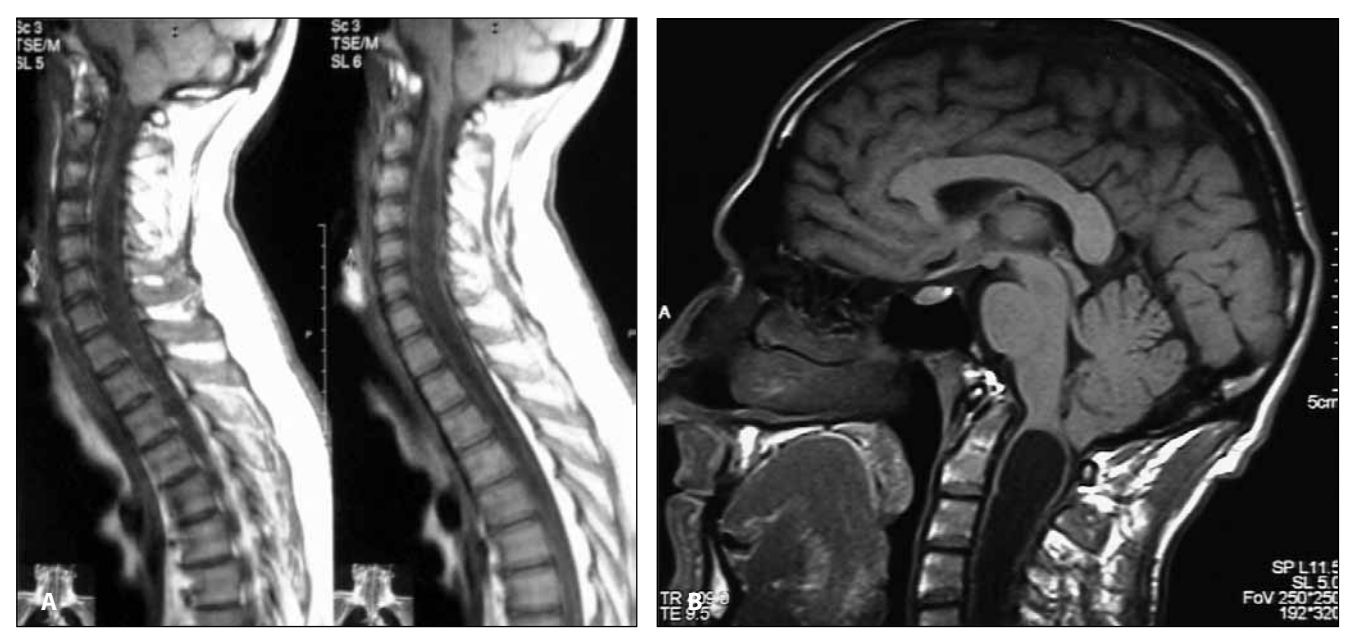
Figure 1: A) T1-weighted sagittal MR images of the craniocervical junction, showing the midline structures of the posterior cranial fossa and the brainstem and the cerebellum, cervical syringomyelia. The cisterna magna is completely obliterated by the thickened posterior rim of the foramen magnum. Note the lack of hindbrain herniation. There is a CSF block at the inferior pole of the cerebellar tonsils. B) Preoperative sagittal T1-weighted craniocervicospinal MRI shows impacted cisterna magna, diminished fourth ventricle and cervicothoracal syringomyelia.

In 1997, Iskandar et al. presented five children with syringohydromyelia, where clinical and radiological resolution was demonstrated after posterior fossa decompression, at the 47th Meeting of the AANS/CNS Joint Section of Paediatric Neurosurgery (6). None of the patients had hindbrain herniation. Their course was similar to that of patients