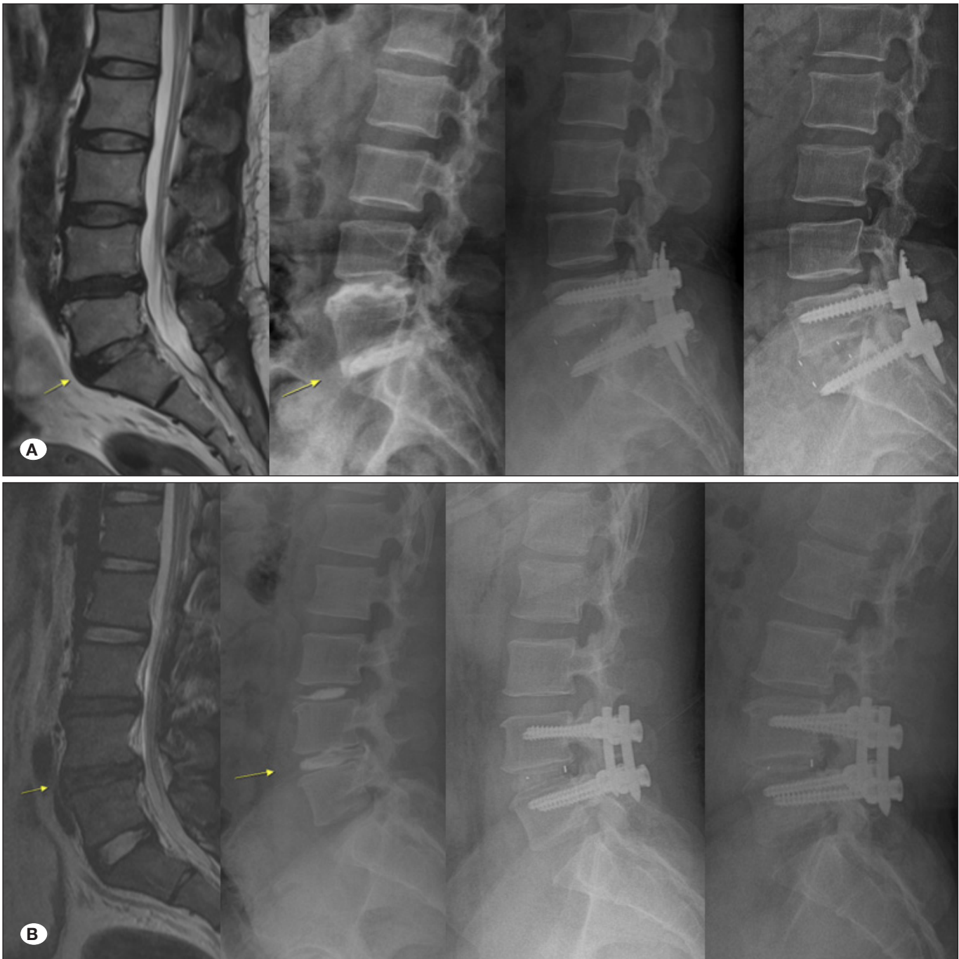
Figure 2: Representative case illustrations. A) A 46 years-old female patient with severe low back pain underwent oblique lumbar interbody fusion at the L5–S1 level. Preoperative MRI and discography revealed degenerative disc disease at the L5–S1 level. Immediate postoperative simple radiograph showed significantly increased disc height of the L5–S1 level. Finally, 1-year after surgery, a simple radiograph showed a fused state with maintained disc height of the L5–S1 level. B) A 22 years-old male patient with intractable low back pain underwent unilateral transforaminal lumbar interbody fusion at the L4–L5 level. Preoperative MRI and discography revealed degenerative disc disease with endplate sclerosis at the L4–L5 level. Immediate postoperative simple radiograph showed increased disc height of the L4–L5 level. However, 1-year after surgery, a simple radiograph showed slightly decreased disc height of the L4–L5 level.