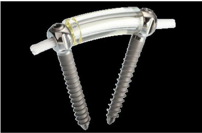
Figure 1: Dynesys dynamic system.

data, while the t-test, ANOVA, or Kruskal–Wallis test (a non-parametric option) was used to compare data between groups for continuous data. A two-tailed p < 0.05 was considered to show statistically significant differences.