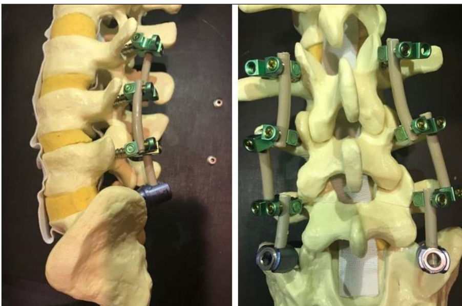
Figure 3: Orthrus dynamic system.