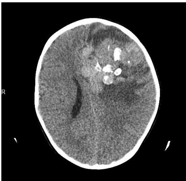
Figure 1: Non-enhanced axial cranial CT reveals an extra-axial mass lesion on the left frontal region with prominent calcifications.

HPC and meningiomas are both extra-axial tumors presenting with similar imaging findings, including dural tail and enhancement after contrast injection. However, there are some clues, although not fully discriminative, that may help in differentiating HPCs from meningiomas. HPCs have more heterogenous texture, enhancement pattern and narrower dural tail (2, 6). Calcifications usually point to meningiomas instead of HPCs, with some rare exceptions. To the best of our knowledge, the above reported patient is the seventh case of HPC presenting with calcifications (2, 6).