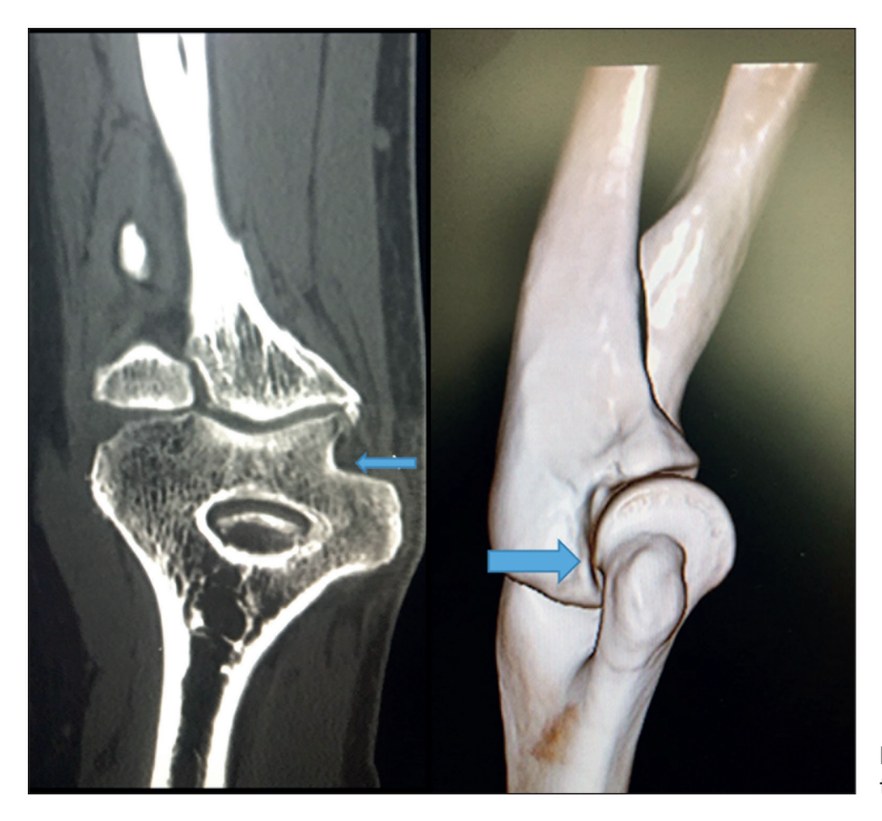
Figure 1: 3D CT image of the cubital tunnel. Obstruction of the cubital tunnel with osteophytes.