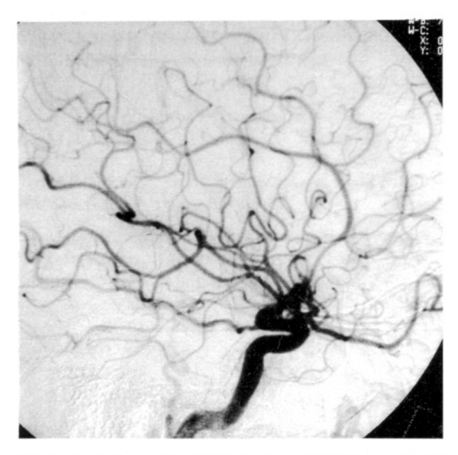
Figure 1a. Left vertebral arteriogram. Left P1 segment is faintly visualised (arrowhead).