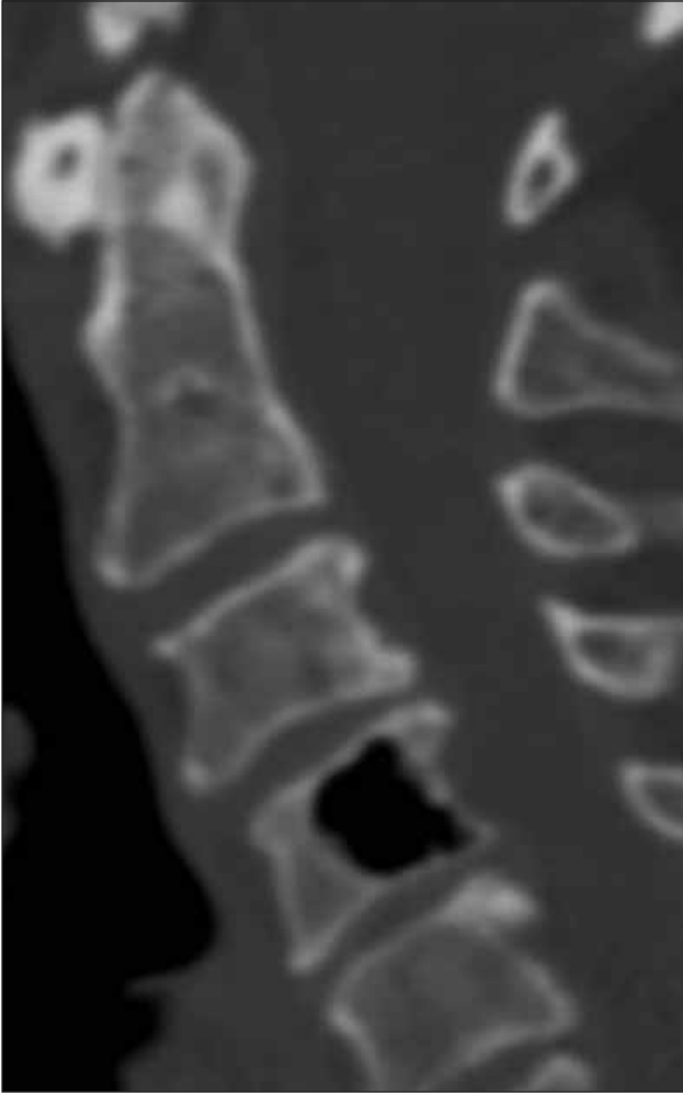
Figure 3: Sagittal section of cervical vertebrae CT showing pneumatocyst in the body of C4 vertebra.