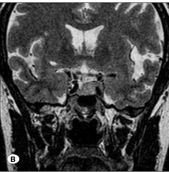
Figure 1: A) Preoperative T1-weighted MRI scan with Gadolinium showing the pituitary mass lesion. B) Preoperative

T2-weighted MRI scan showing the pituitary mass lesion