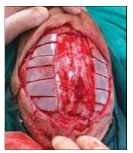
Figure 1: Barrel stave osteotomy in a patient with sagittal synostosis.

Of the cases, the mean age was 7.4 months (1-48 months), mean body weight was 8.26 kg (3.5-16.0 kg) and mean height was 65.5 cm (49-97 cm), respectively. Mean anesthesia duration was 148.7 minutes (60-270 minutes) and mean surgical time was 124.4 minutes (40-240 minutes), respectively. The preoperative mean hemoglobin level was 11.6 g/dL (9.0-17.1 g/dL) and mean hematocrit level was 34.4% (27-54%). respectively. In the intraoperative period, all the cases were administered a mean 8.61 ml/kg erythrocyte suspension (ES). In the postoperative period, 92 cases (64.0%) were administered a mean 7.98 ml/kg erythrocyte suspension. The postoperative first hour mean hemoglobin level was 11.1 g/ dL (8.9-14.7 g/dL) and the mean hematocrit level was 34.8% (26.4-48.0%). The postoperative sixth hour mean hemoglobin level was 10.3 g/dL (8.7-15.1 g/dL) and the mean hematocrit level was 33.5% (25.4-46.1%) (Table I).