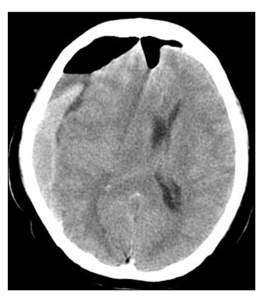
Figure 2: CT scan immediately after extended transsphenoidal surgery. A right subdural hematoma appears to compress the brain.

Figure 1: Preoperative MRI findings. Left: coronal section. Right: sagittal section. A cystic craniopharyngioma extending from the sella to the suprasellar region is observed.