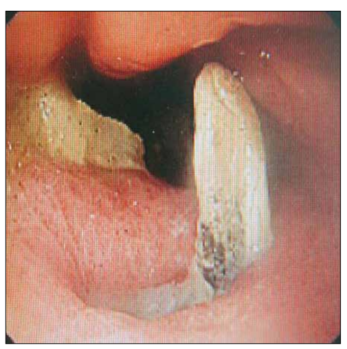
Figure 1: Gastroscopy showing a cement embolus penetrating the gastric wall.

An unknown foreign body, about 30 centimeters from the incisors, was detected perforating the gastric wall by gastroscope (Figure 1). It was quite stiff and could not be removed. Post-operative X-Ray demonstrated cement leakage from the anterior wall of the vertebral body (Figure 2A, B). Computed