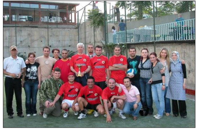
Figure 6: A photo from our soccer team after a victory in the Gazi University football tournament.