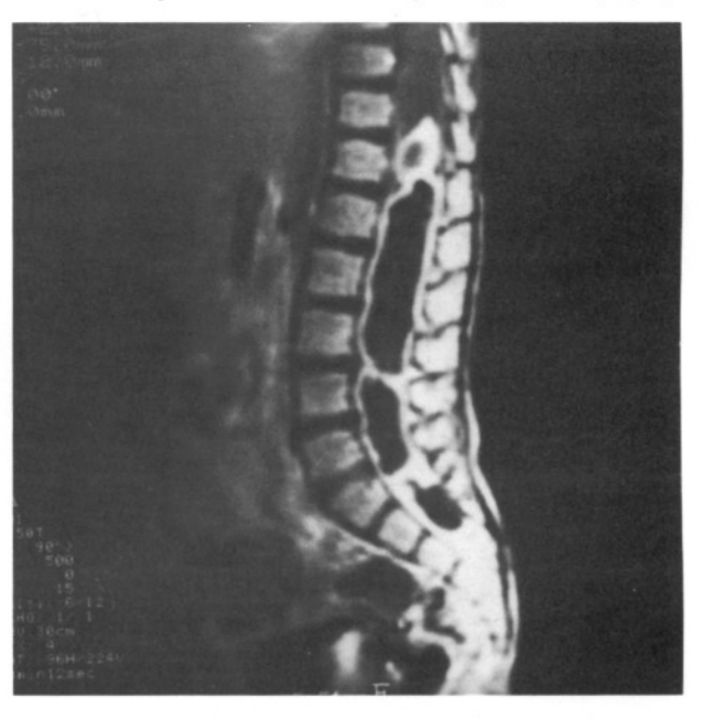
Fig. 1 : T1-weighted midsagittal MRI after gadolinium administration; showing a hypointense, multilobulated mass with an enhanced surrounding zone and extending from Th10 to S1.

mass surrounded with a thick ring of contrast enhancement, extending from Th10 to S2, with intramedullary and extramedullary components (Fig.1).