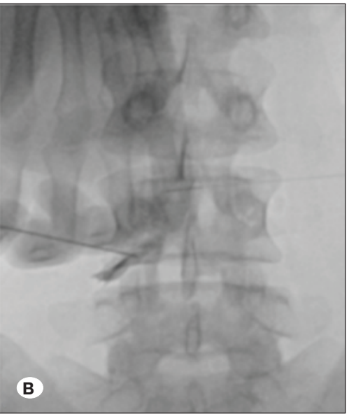
Figure 2: Lumbar transforaminal epidural steroid injection under C-arm fluoroscopy. A) Lateral view, B) anteroposterior view.