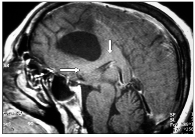
Figure 2: An MRI (T1-weighted sagittal view) showed displacement of the anterior body of the corpus callosum. Cyst dimensions were as follows: 61x65x69 mm. The mass of the AC was believed to be the reason for the symptoms.

An early postoperative evaluation (patient attention, perception, and memory dysfunction) was excellent and it appeared that the patient made a full