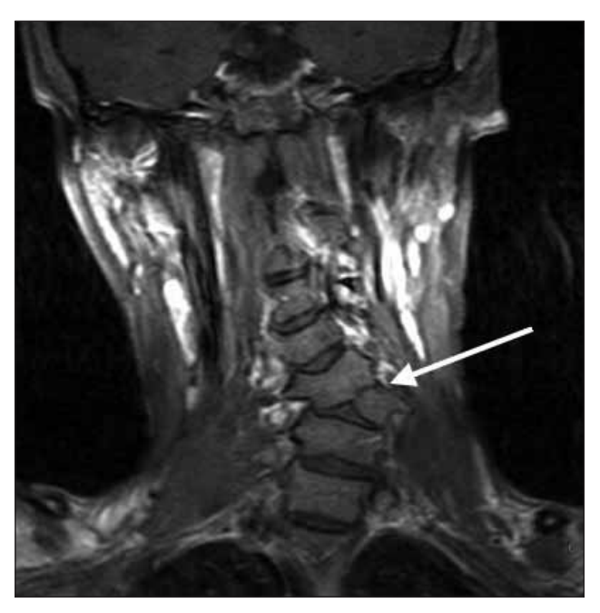
Figure 1: Coronal T-1 weighted cervical MRI section shows scoliosis and hemivertebra formation at the C6 level (arrow).

An 18-year-old female was admitted to our department with a six-month history of neck pain and progressive weakness in her upper extremities, especially in finger adduction. Neurological examination revealed mild paresis in the upper extremities and increased deep tendon reflexes. Plain X-rays and magnetic resonance imaging (MRI) of the cervical spine revealed scoliosis and hemivertebra formation at the level of C6 (Figure 1). Cervical MRI of the spine showed an intradural lesion with an intramedullary extension at the C3 (Figure 2). The patient underwent decompression of the spinal cord via C3 laminectomy. Following the dural incision, a yellowish intradural mass extending into the spinal cord was detected. The greater bulk of the intradural mass showed typical features of a spinal lipoma, including its tight adherence to the spinal cord and lack of cleavage planes that prevented a clear separation of the lesion from the spinal cord. A subtotal microsurgical resection was performed with sufficient spinal canal decompression. The postoperative period was uneventful and the patient was discharged on the 3rd postoperative day without additional neurological deficit. The histopathological examination revealed that the lesion was uniformly composed of mature adipose tissue and the diagnosis was consistent with a lipoma. The patient was free of symptoms except for mild neck pain with a normal neurological examination at her 6-month follow up.