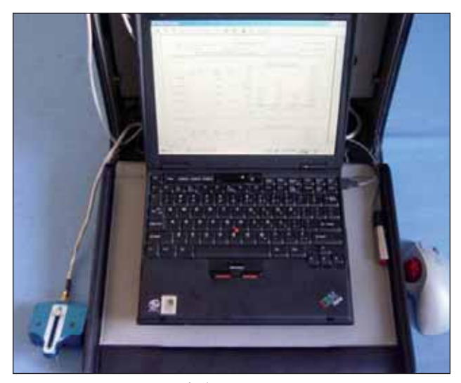
Figure 1: Pressure-Specified Sensory Device.

In 1989, a computer-based device [Pressure-Specified Sensory Device (PSSD), Sensory Management Services, Baltimore, MD] was developed by A. Lee Dellon. (Figure 1) The continuous cutaneous pressure can be measured with PSSD using a hemispheric probe attached to the force transducer which enables one-point static (Merkel cell-neurite complexes, Ruffini complexes), one-point moving (Pacinian and Meissner corpuscles), and moving and static two-point (innervations density) discriminations.9