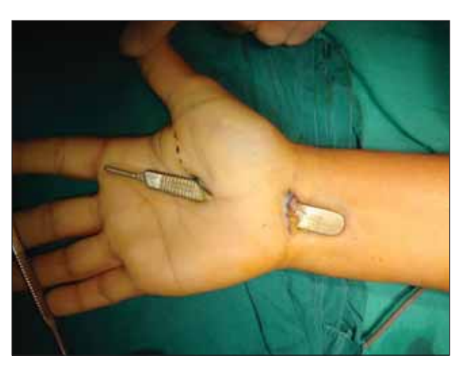
Figure 5: The scalpel under the carpal tunnel.