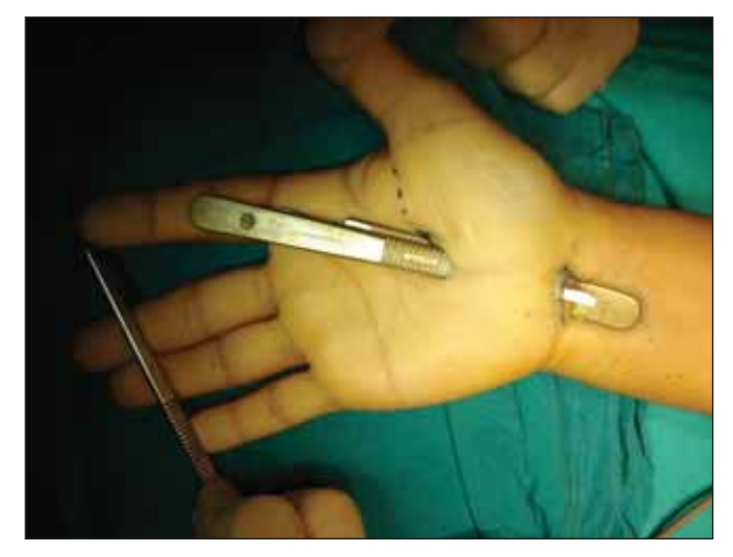
Figure 6: A no. 15 blade, below the flexor retinaculum and above the scalpel.