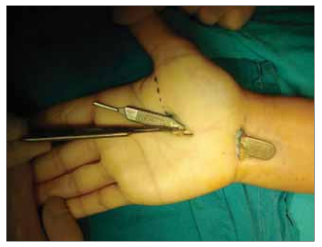
Figure 7: Release of the fexor retinaculum with using the scalpel.

The incisions were closed with interrupted 4-0 nylon sutures and a pressure bandage was applied. The tourniquet was then released. No splint was used, and the patients were encouraged to move their hands and fingers in the immediate postoperative period. The original dressing was removed after 5 days, and the stitches were removed after 10 days.