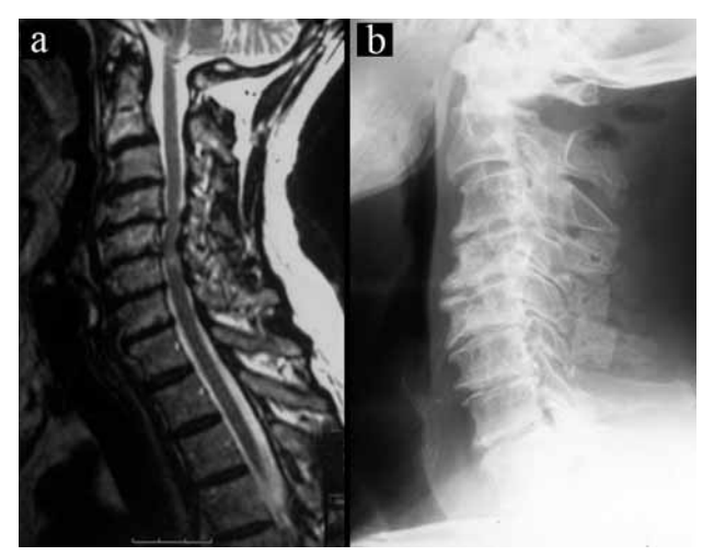
Figure 2: ( A ) Preoperative MRI of a 60-year-old man with cervical spondylotic myelopathy. ( B ) Postoperative radiography after French-door laminoplasty. In this case of three-level stenosis, allografts for median reconstruction at C4,C5, and C6 levels were used.

to 5). Pre- and last postoperative kyphotic evaluation was measured using the sagittal tangent method (Table I). Pre- and postoperative results were compared statistically with the t-test (P<0.005). About four degrees of anterior angulation was found after the operation at the long-term radiological investigation but there was no clinical problem. Patients presented with decompression of two to five levels (average, four levels). One patient underwent decompression and laminoplasty at two levels, five at three levels, 11 at four levels, and two at five levels. The mean operating time was 180 minutes, and mean blood loss was 300 cc. Mortality did not occur during or after surgery. Clinical evaluation showed that all patients (19 of 19, 100%) had reduced postoperative complaints compared to their complaints before the procedure. According to the Nurick classification, nine patients demonstrated improvement of one grade, three patients improved by two grades, and seven patients were unchanged. Postoperative complications were observed in two patients who developed temporary C5 nerve root paralysis. Both patients experienced complete recovery within two months.