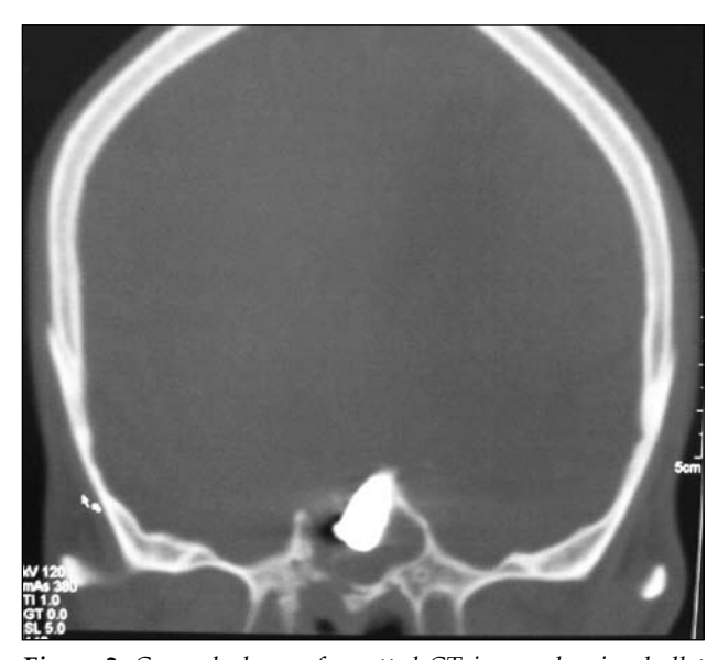
Figure 2: Coronal plane reformatted CT image showing bullet within sphenoid sinus and its tip penetrating into sella. There is breach of the inferior wall of sphenoid sinus on the right side of midline compatible with the entry site of the bullet.