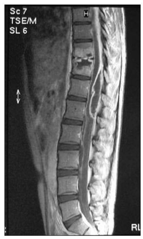
Figure 1: Sagittal, contrast-enhanced T1-weighted turbo-spin echo (TSE) MRI demonstrating an intradural-extramedullary lesion from T12 to L3 with circumferential enhancement and spondylodiscitis at T10-T11 level.

Polymerase chain reaction (PCR) for mycobacterium tuberculosis and acid-fast bacilli in Ziehl Nielsen stain were positive on the surgical material; however, culture from the sample remained sterile for bacteria, fungi or mycobacterium tuberculosis. Histopathological examination of the surgical material revealed granulomatous inflammation including coagulation necrosis surrounded by epithelioid histiocytes, lymphocytes and multinuclear giant cells. Imaging studies of the