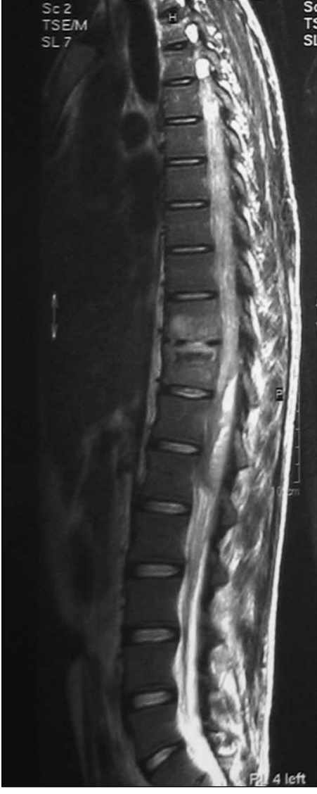
Figure 2: Sagittal T2-weighted MRI image of high thoracic levels prior to first surgery of the patient. There is no sign of any syringomyelia in this image.