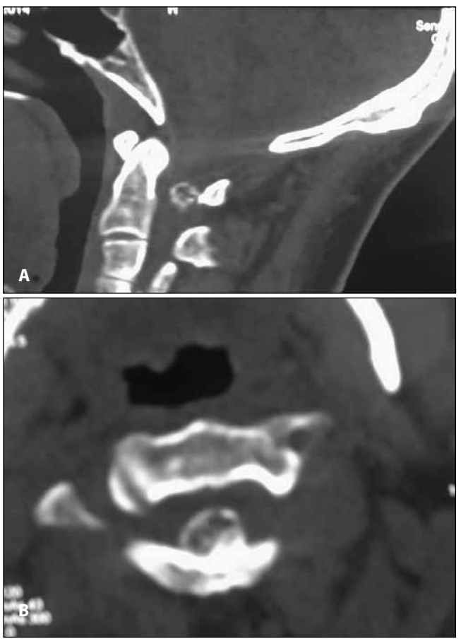
Figure 1A,B: CT scan showing well defined tumour arising from the anterior surface of the posterior arch of the atlas.