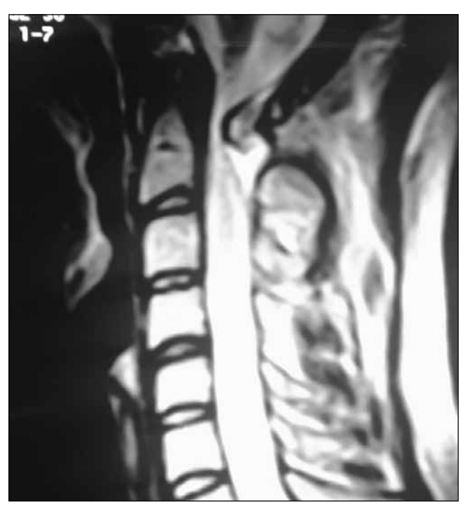
Figure 2: Sagittal T2-weighted MRI revealing compression of the cervico-medullary junction posteriorly by the tumour.