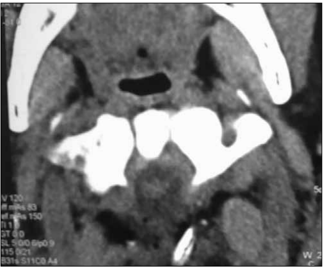
Figure 4: Postoperative CT scan showing complete excision of the tumor.