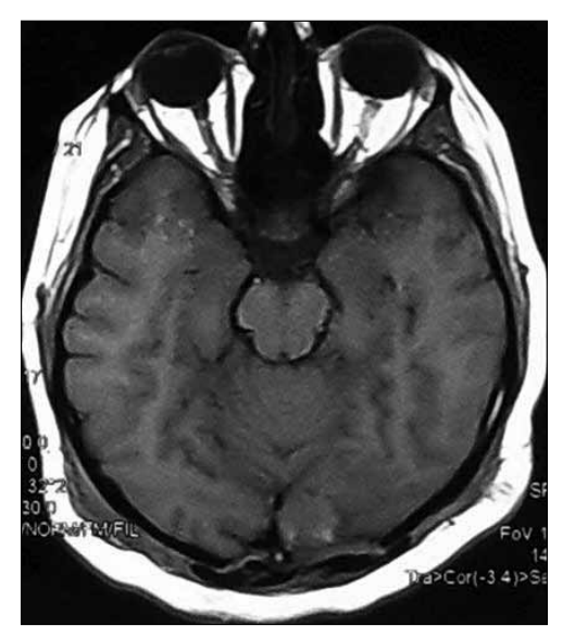
Figure 1: MR T1-weighted precontrast images of our patient. Axial image show a hypo-intense lesion at left occipital region. Slight edema is seen represented as hypointense areas around the lesion.

occiptal region. MR spectroscopy demonstrated a decrease in NAA/Cr and increase in Cho/Cr (Figure 3). There was a strong suspicion of a glial tumor. Surgery was performed using left occipital craniotomy. The mass was firm and avascular. The mass was resected totally. The postoperative period was