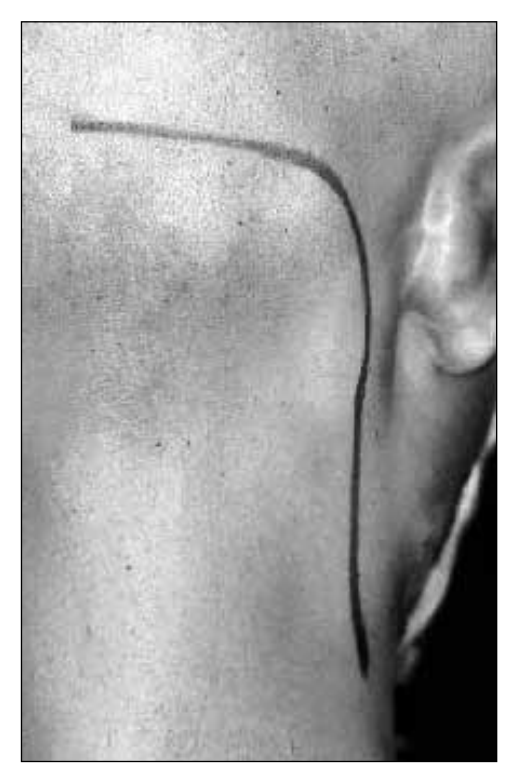
Figure 1: Hockey stick skin incision. The vertical limb is started 7-8 cm below the mastoid process.

A hockey stick skin incision is made. The vertical limb is started 7-8 cm below the mastoid process and is extended cranially along the posterior border of the sternocleidomastoid muscle. The transverse process of the atlas can be palpated along the vertical limb just below the mastoid tip (Figure 1). At the base of the mastoid, the incision is carried medially just below the superior nuchal line. This transverse limb is carried medially up to the midline. The skin and the muscles superficial to the muscles of the suboccipital triangle are reflected as a single layer. The posterior arch of atlas is exposed. A small cuff of muscle and fascia is left attached to the superior nuchal line for closure.