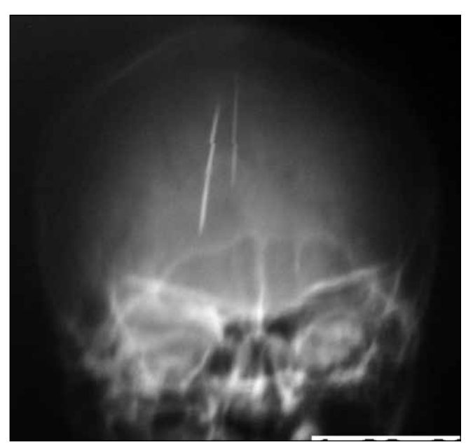
Figure 1: Craniography showing two sewing needles that are directed downwards.

Usually intracranial sewing needles are detected accidentally after a minor head trauma (1,3,5,6). If needles are noticed after a short time period they must be taken out because of