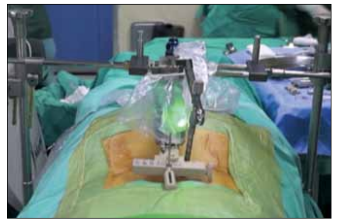
Figure 3: The correct coordinates are received by the robot and K-wires onto this trace.