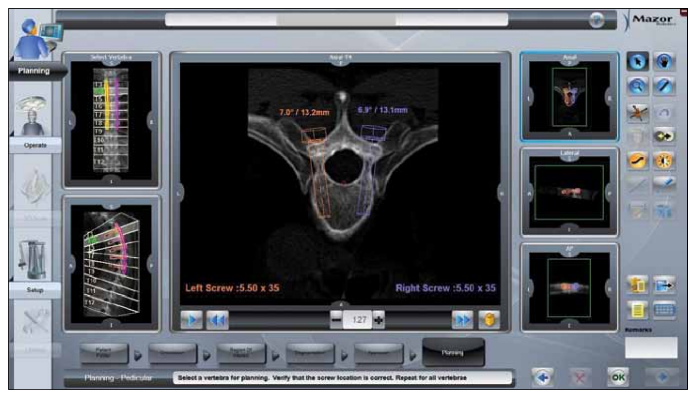
Figure 1: Preoperative planning with the software of Renaissance.

We evaluated the results of a prospective study conducted at our clinic on 27 patients who underwent a thoracolumbar stabilization aided by a robotic system during 2012-2013. The patients were assessed in terms of the results obtained from preoperative dynamic radiographs, magnetic resonance imaging (MRI) and CT. Postoperative surgical results were based on CT. Preoperative and postoperative CT was performed according to the Renaissance CT protocol where a lesser dose was administered in the classical CT mode and approximately 12 cGy radiation was applied. Preoperative pedicle locations of TPSs determined in a computer medium