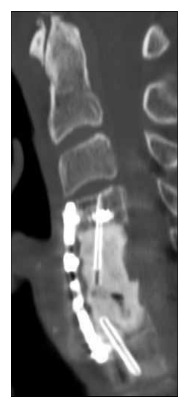
Figure 5: CT scan 18 months postoperatively.

region with minimal detection of systemic levels. In animal models, elution is maximal the first day, greatly declines on the second day, and then gradually decreases until stabilization at 5-10 days (9,23). High local concentrations are noted at 10 weeks with low serum levels; the advantage of this delivery