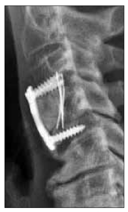
Figure 8: Extension x-ray cervical spine 36 months postoperatively.