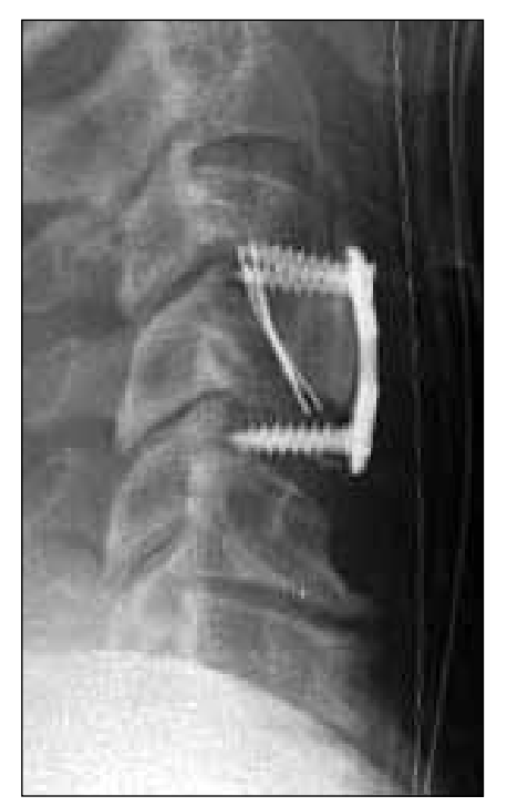
Figure 7: X-ray cervical spine immediately postoperatively.