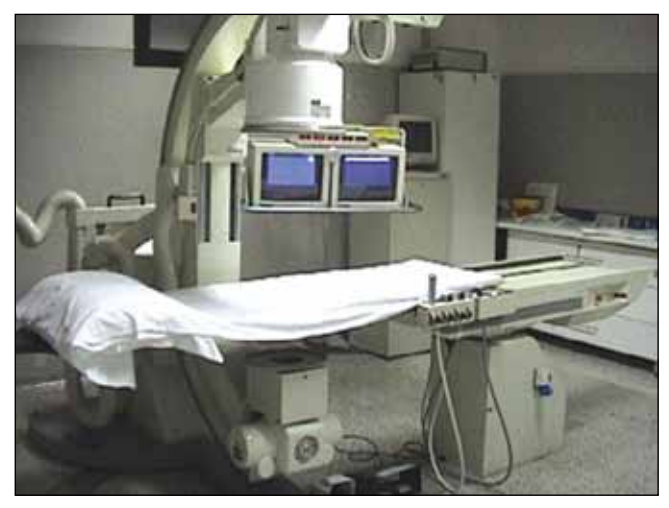
Figure 1: The operating room design and C-arm fluoroscopy for PLDD procedure.

Written informed consent about the treatment protocol was obtained from all patients before the procedure. A total of 197 (0.02%) patients among the 79979 patients underwent PLDD treatment between 2007 and 2009. Of the 79979 patients, 9541 patients presented to neurosurgery, 29360 patients presented to physical therapy, 19550 patients presented