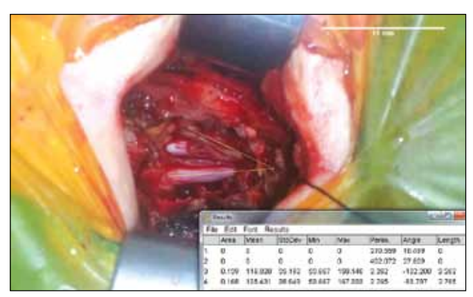
Figure 2: Roots angle and thickness measurements with ImageJ program from the operation records.

Nerve root thickness was measured using the ImageJ program. Accordingly, the mean nerve root thickness was 1.92 mm± 0.45 mm for medially located roots and 3.33 mm±0.95 mm