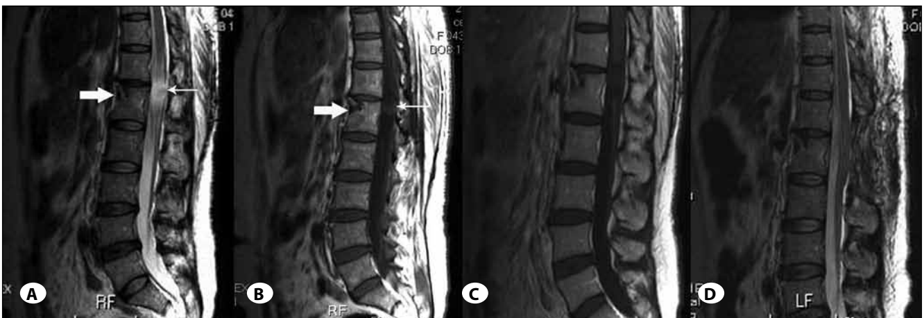
Figure 2: Spinal MR images: T2-weighted (A) and T1 weighted (B) sagittal image showed a hyperintense intradural extramedullary cauda equina mass lesion at L1 (small arrow) and a sequela of fracture (big arrow). The mass had no contrast enhancement following gadolinium injection in T1 weighted image (C). Postoperative T2-weighted sagittal image showed that the cyst was completely removed (D).