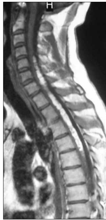
Figure 2: Sagittal T-1 MR images showed a huge syrinx cavity with hyperintense fat content from C-4 to T-5.