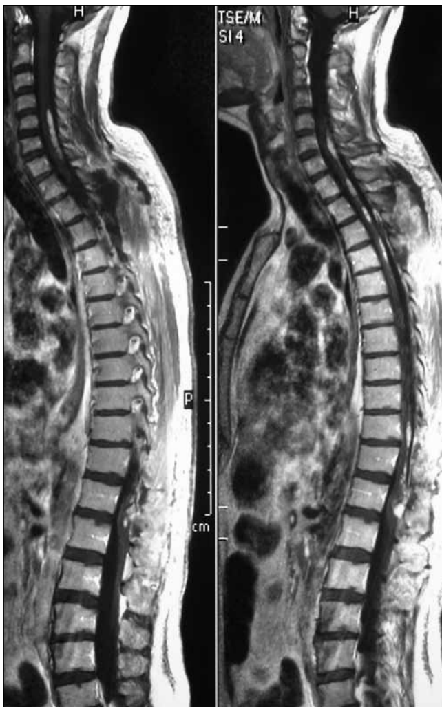
Figure 4: Early post-operative gadolinium-enhanced sagittal T-1 MR images showed resolution of the syrinx cavity and fatty contents and post-operative enhancement in the removed area of the conus medullaris mass lesion.

Treatment of dermoid cysts is primarily surgical and there is no current role for radiotherapy or chemotherapy in the treatment of these tumors. Steroids are useful in the treatment of meningitis (8).