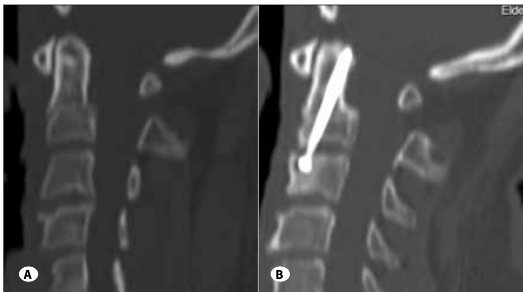
Figure 3: A) Preoperative and B) postoperative 6 th month CT showing the odontoid fracture type II and fusion (Group II).

Although our number of patients is limited and we need larger series, we think that the Ozer's anterior transodontoid screw fixation technique may help to increase the healing capacity of fractured sites of type II fracture. This technique may be chosen for the suitable patients for the fusion of type II odontoid fractures.