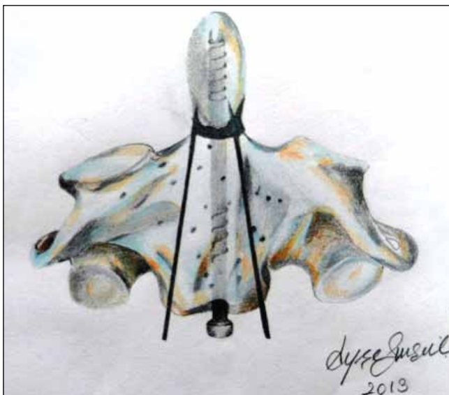
Figure 1: Illustration showing the technique of operation.

In our series, all of the patients (100%) who were operated with Ozer's technique showed fusion after six months. The fusion rate was higher than in the second classical group (83%). We did not observe neurovascular damage, infection, and instrument-based problems etc. in either group. All of the patients in both groups were fused with a single screw. The patients of both groups have used a cervical collar for 3 months after the surgery.