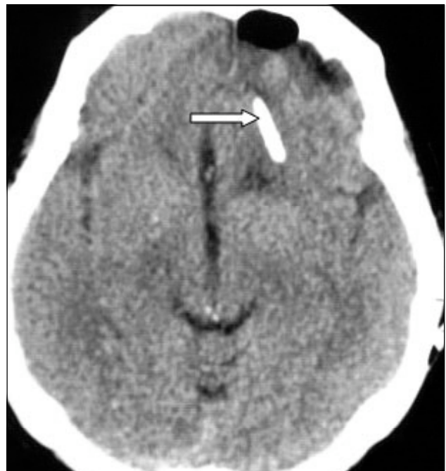
Figure 3: A postoperative CT showed the shunt catheter tip in the remnant cystic area.

memory recovery. Verbal communication was excellent. However, neuropsychiatric abnormalities were observed. A neuropsychological evaluation of memory using the WMS-R test was performed, 10 days postoperatively, the VEM score had improved to 75 points, VIM to 85 points, GM to 155 points, and DR to 98 points. Computed tomography revealed decompression of the left frontal lobe and all behavioral and vertiginous disturbances completely resolved. The shunt catheter tip was visualized in the remnant cystic area (Figure 3) and the patient had fully recovered at discharge.